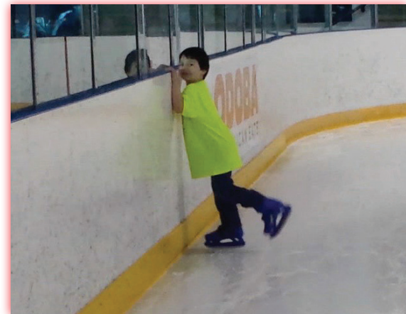
Holding on at The Wichita Ice Center.

KPTS Kids Club members enjoy various events throughout the year. Events designed not only for fun, but to educate. Things started off with a visit to the Wichita Ice Center. While there the members got to go behind the scenes to see how things worked. Then they hit the ice. Everyone had a good time. They learned about curious creatures during a visit at The Bug Lady's Science Academy. KPTS Kids Club members love sports and they got the opportunity to go to Stryker Soccer Complex and watch a professional soccer game. During halftime they got to show off their soccer skills on the field. The annual KPTS Kids Club Big Bash was held at the Cowtown Museum. The members got to tour the grounds and they learned how children played in the late 1800s. Afterwards it was pizza for everyone. It was a great way to end the 2017 season of KPTS Kids Club.