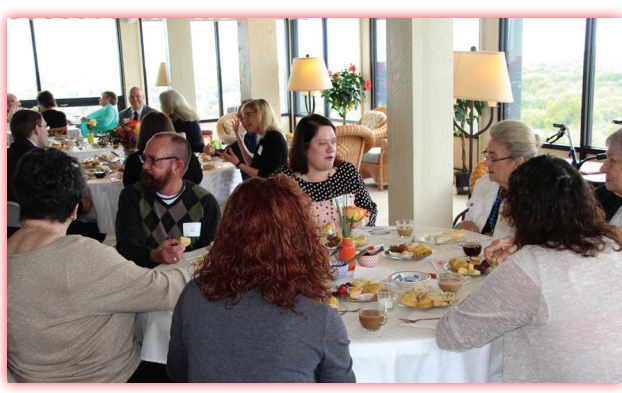
KPTS BritCom Club members at the first annual High Tea.