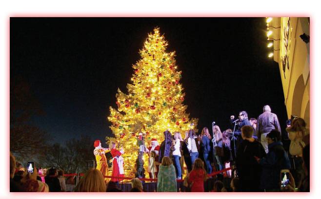
A scene from Christmastime in Wichita . It was shot at Bradley Fair .